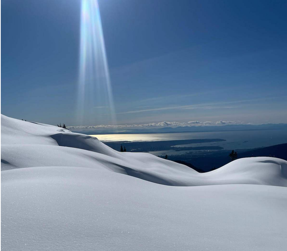
The view from Mt. Seymour in early March 2025.