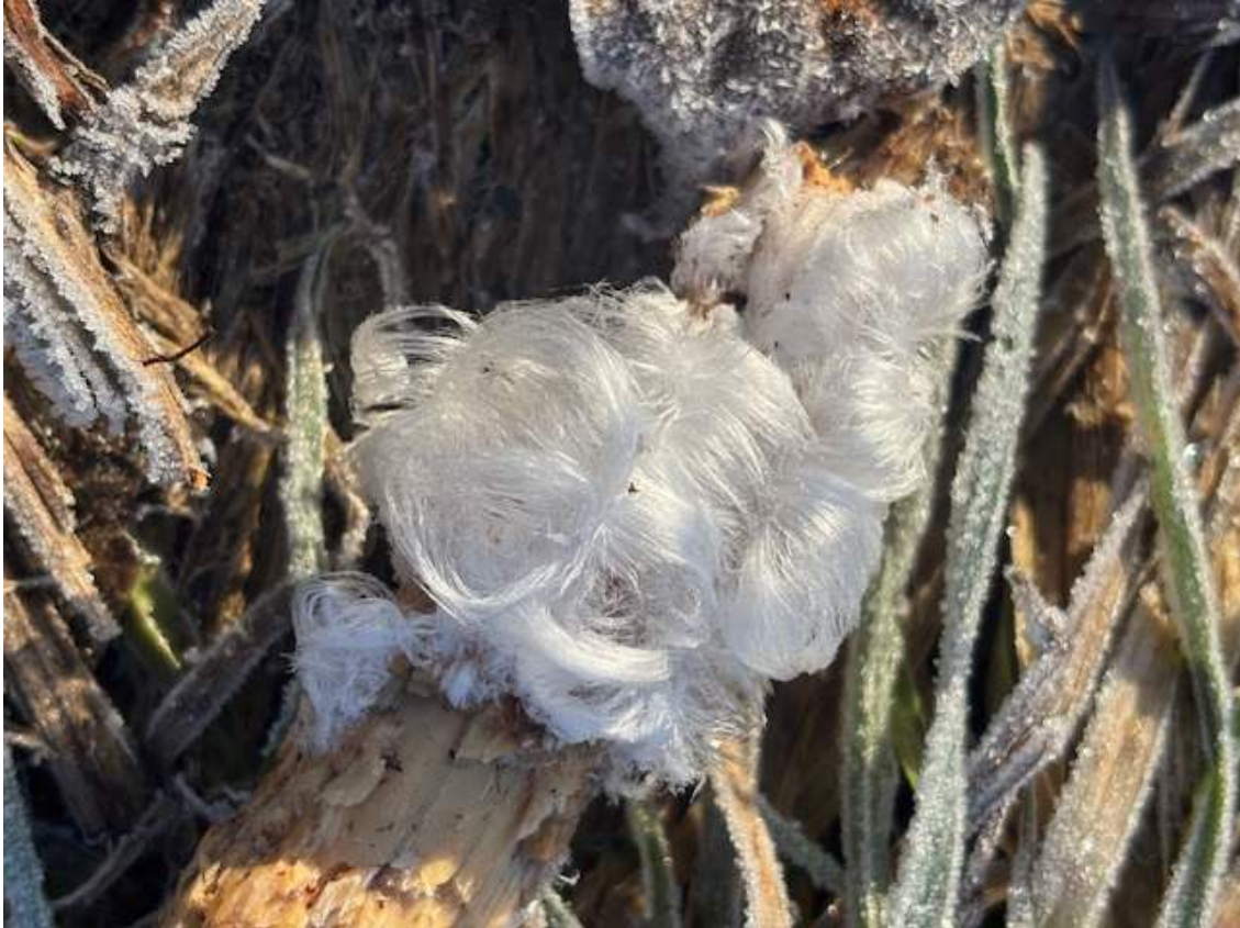
Hoar frost on a local trail.

I don't know about you, but spring is arriving at a rather alarming rate. 2025 only just began, and it seems winter was a thing until moments ago.