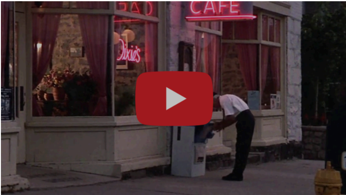
Eighteen very relevant seconds from the film Roxanne