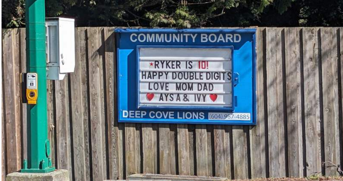
Deep Cove community board.