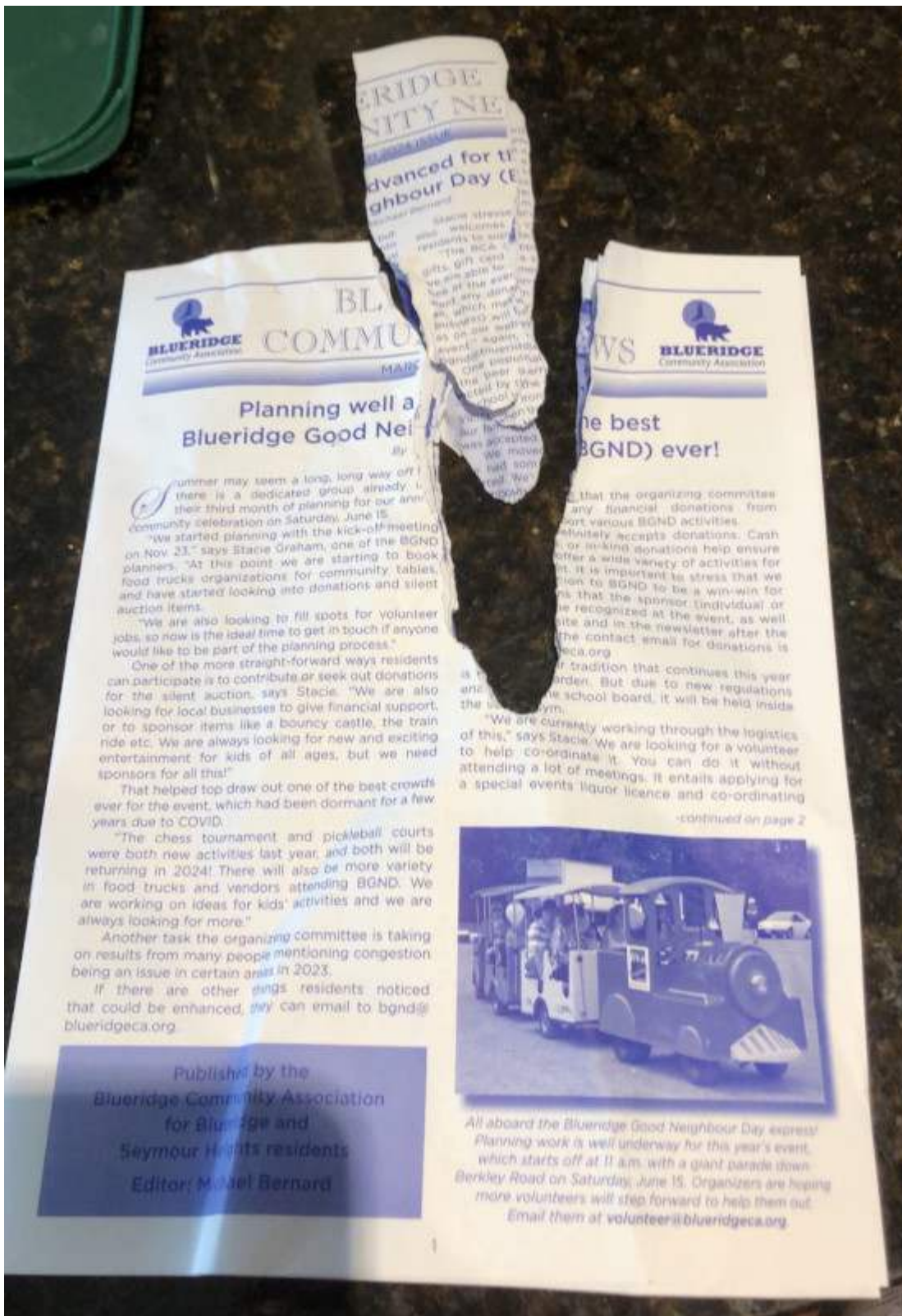
"Altered" Blue Ridge Community News by Jip.