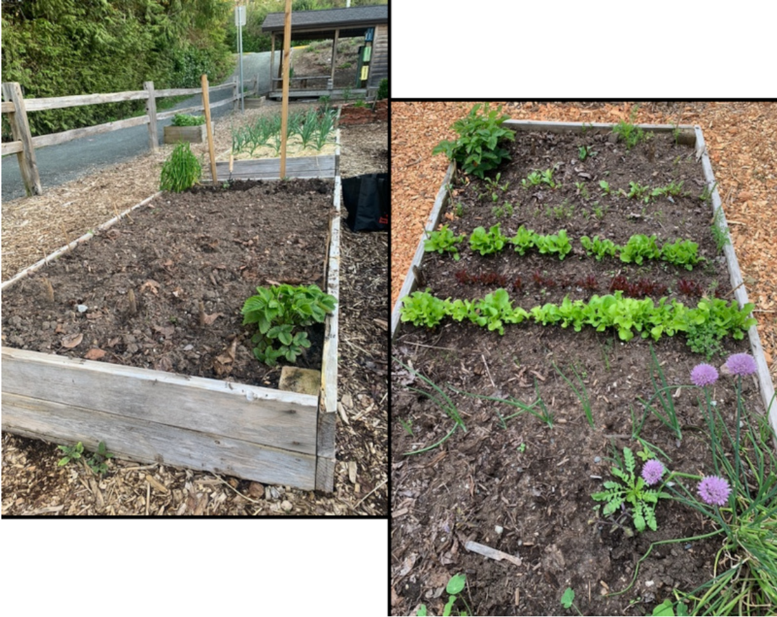
The same garden box on April 20 and May 16.