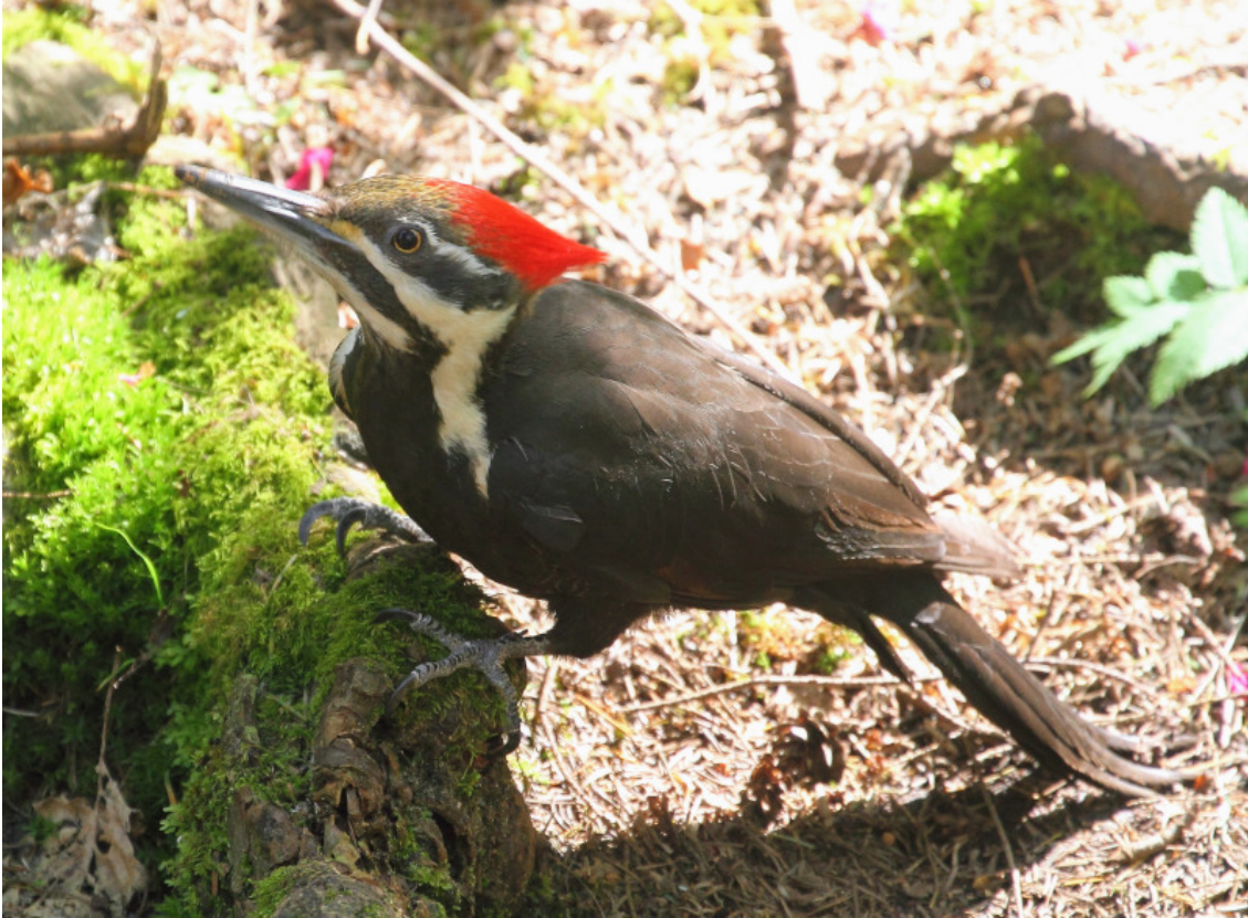
Female Pileated Woodpecker