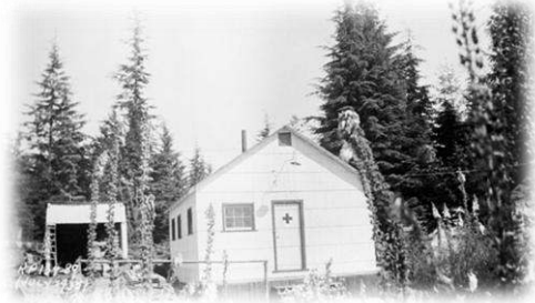
“(Relief Projects - No. 134). The camp hospital.” July 1935.

This is a fascinating story that few of us know about. At the next Blueridge Community Association meeting, (November 18, 7 pm at Blueridge Elementary), I will be presenting the information I have collected for all to see and hear. If you are very keen, I will also be speaking to the Deep Cove Heritage Society on Thursday, November 6 at 10:30 am at the Deep Cove Cultural Centre.