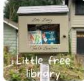
Little free library