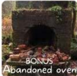
BONUS Abandoned oven

Created by Nicole Hiebert for North Shore Kids 2020